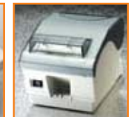
Splash Proof Cover